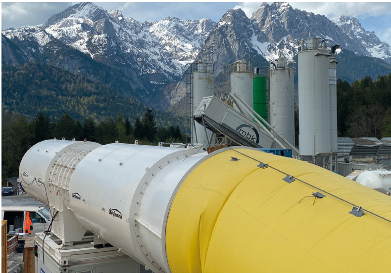
Fig. 2: View of the construction site with ventilation equipment of the CFH Group

The rest of the route runs north of the US housing estate (Breitenau Family Housing) in a south-westerly direction along the foot of the mountain range and joins the existing B23 near Schmölz with two bridges over the River Loisach. The total length of the bypass is 5.56 km. For traffic coming from the direction of Munich, a loop ramp is under construction for the Garmisch/Burgrain junction to the north, and this will be connected by a roundabout to the Garmisch-Burgrain municipal road. For traffic coming from the direction of Garmisch, an additional direct ramp will be built.