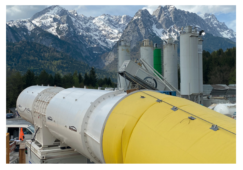
Fig. 2: View of the construction site with ventilation equipment of the CFH Group

The rest of the route runs north of the US housing estate (Breitenau Family Housing) in a south-westerly direction along the foot of the mountain range and joins the existing B23 near Schmölz with two bridges over the River Loisach. The total length of the bypass is 5.56 km. For traffic coming from the direction of Munich, a loop ramp is under construction for the Garmisch/Burgrain junction to the north, and this will be connected by a roundabout to the Garmisch-Burgrain municipal road. For traffic coming from the direction of Garmisch, an additional direct ramp will be built.