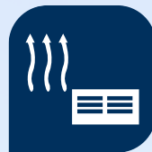
Mine air heating systems