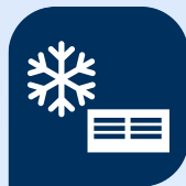
Mine air cooling systems