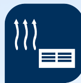
Air heating systems