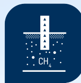
Methane Drainage and Utilization