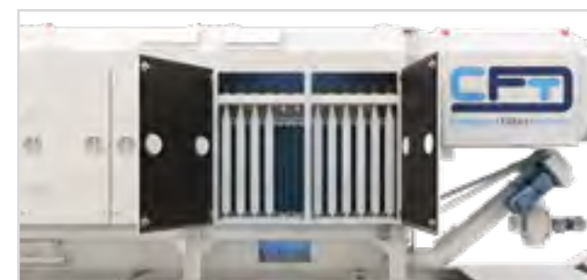
CFD with dust collection hopper and discharge screw conveyor