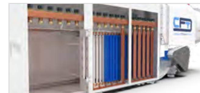
CFD with discharge scraper chain conveyor