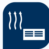
Air heating systems